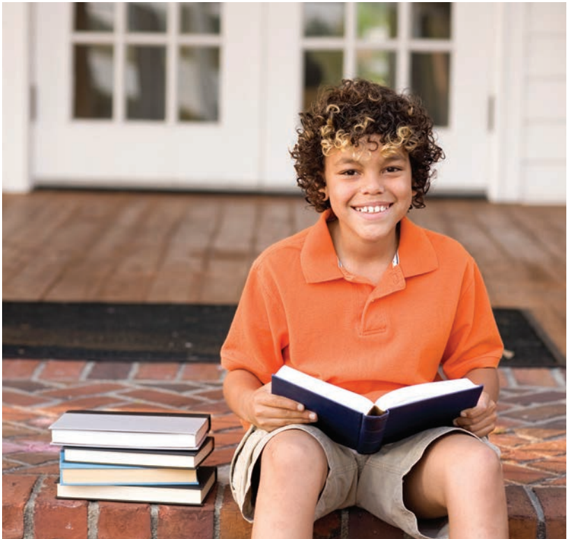
All educators need to be well-versed in the dyslexia research of the last decade because its implications for instruction and intervention are profound.

THE BRAIN FUNCTION STUDIES have found that a specific set of neural network activation patterns, consistently present in the left hemisphere of the brains of proficient readers, are either dysfunctional or absent in less proficient readers.