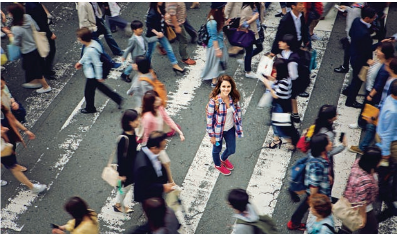
Dyslexia occurs around the world, in every language.

This debate about using the term "dyslexia" to describe problems with accurately and fluently reading words and text continues in part because some students may have significant reading difficulties for reasons other than dyslexia. Poor quality, low-skilled reading can be caused by brain injuries, low levels of language proficiency or language disorders, a hearing or visual impairment (i.e., blindness or deafness), a severe intellectual disability, or simply as the result of a lack of adequate or appropriate instruction.