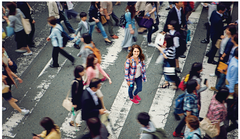
Dyslexia occurs around the world, in every language.

This debate about using the term "dyslexia" to describe problems with accurately and fluently reading words and text continues in part because some students may have significant reading difficulties for reasons other than dyslexia. Poor quality, low-skilled reading can be caused by brain injuries, low levels of language proficiency or language disorders, a hearing or visual impairment (i.e., blindness or deafness), a severe intellectual disability, or simply as the result of a lack of adequate or appropriate instruction.